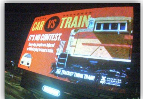
Kellogg & Andover, Wichita